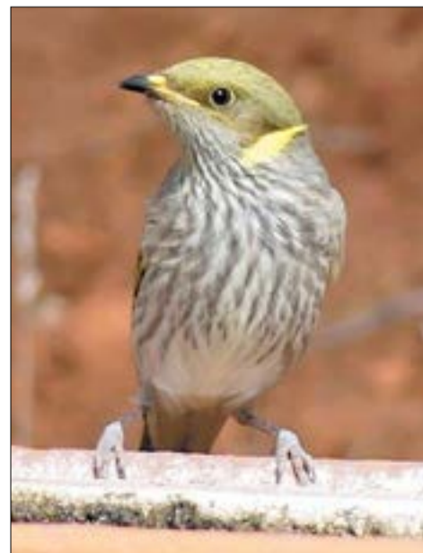
Yellow-plumed Honeyeater.

For advice about sick, injured or orphaned wildlife call Wildcare Helpline on 9474 9055. The volunteer service operates 24/7.