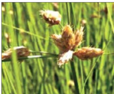
Marsh Club Rush (Caldwellii).

So, if you'd like to join us at one of our working bees, you'd be very welcome.