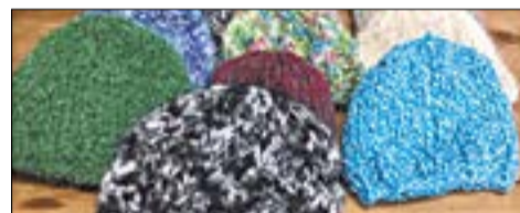
Beanies for Aboriginal children.