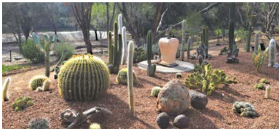
One of the many interesting gardens the Toodyay Garden Club has visited.