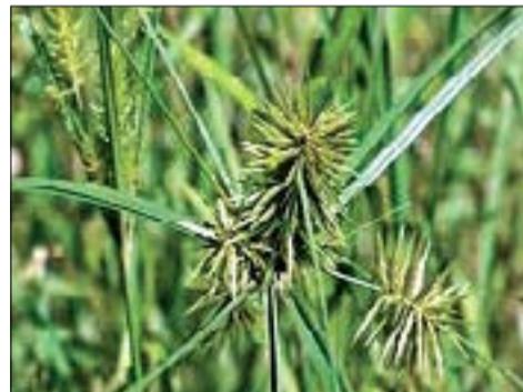
Spiny Flat Sedge (Cyperus gymnocaulos).