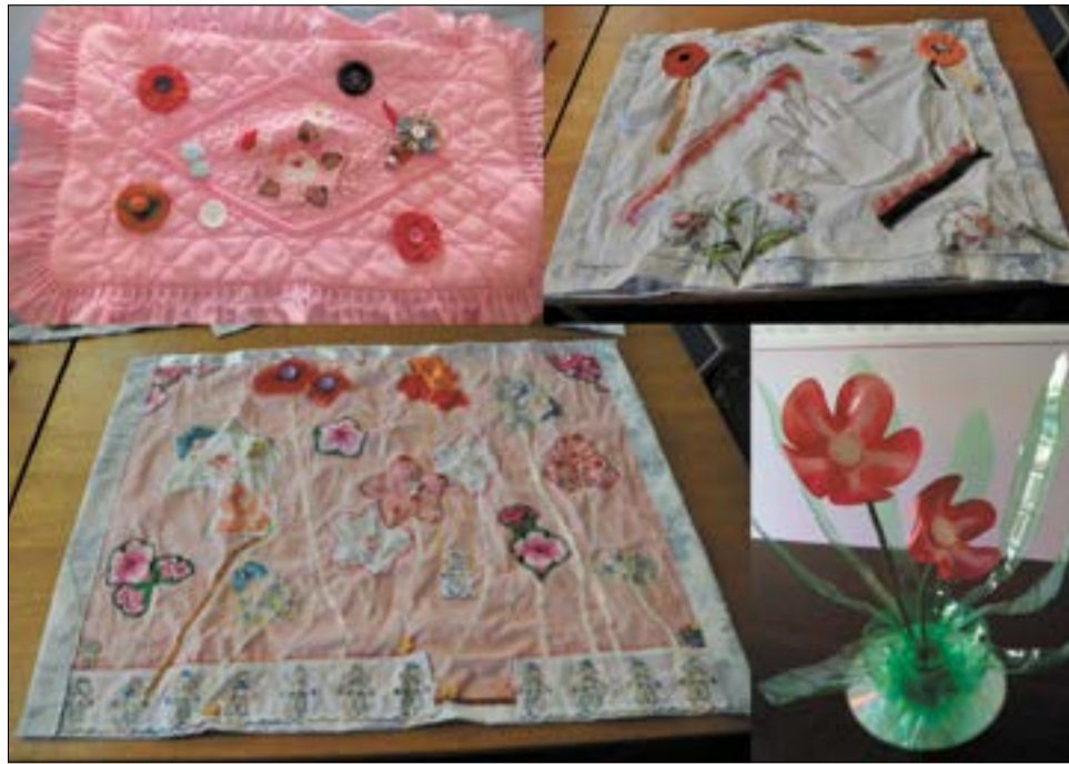
CWA members have not been idle during the Covid-19 lockdown.