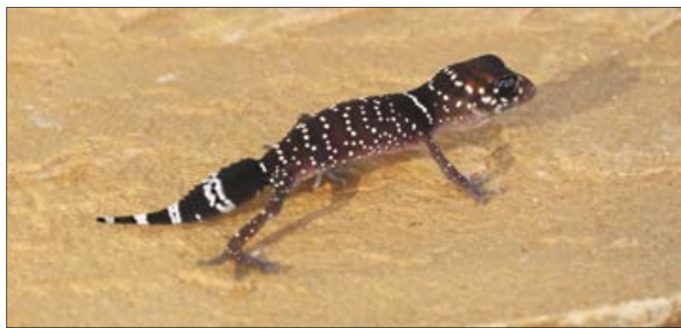
Barking Gecko.

It is more tolerant of cooler weather than