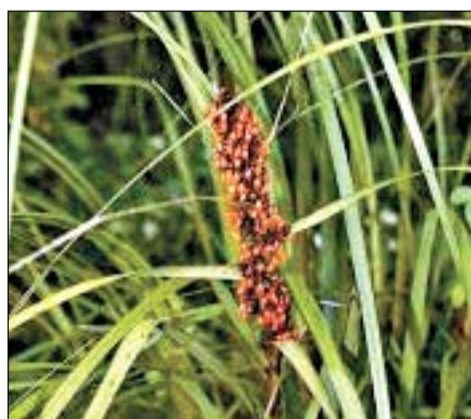
Saw Sedge (Gahnia aspera).