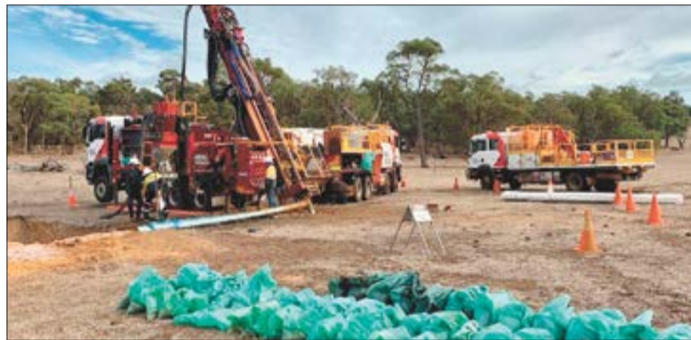
Chalice's reverse circulation drilling rig in Julimar.