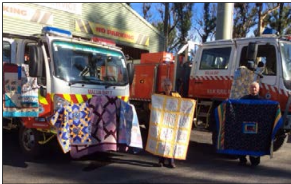
Members of the Malua Bay Rural Fire Service with the Ragbags' quilts. In the background, some of the bush is regenerating since the fires impacted the area.