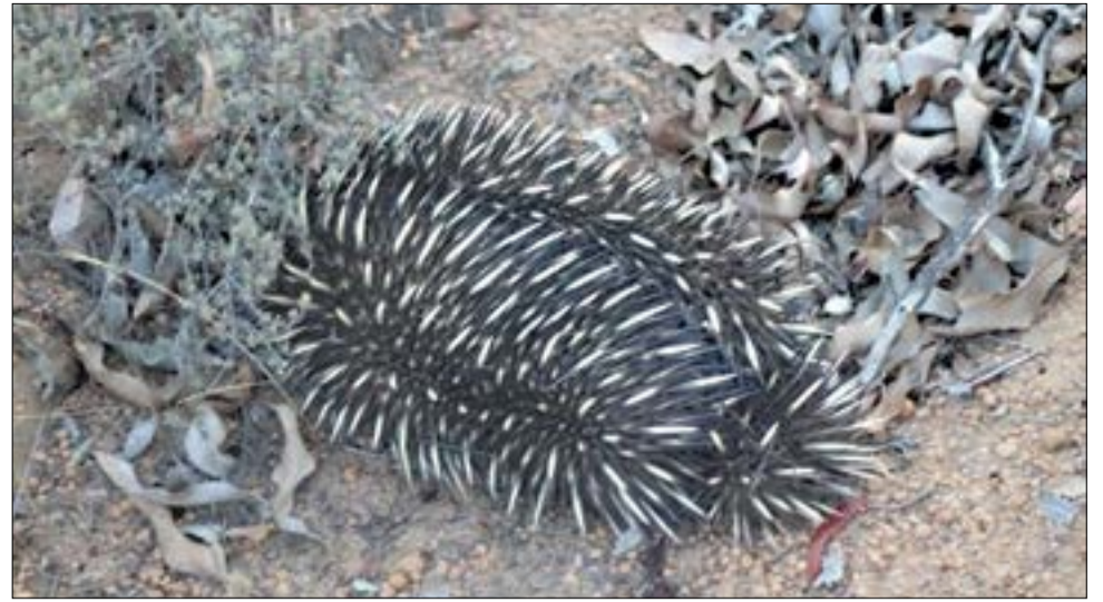
The Echidna rolls into a ball when threatened.