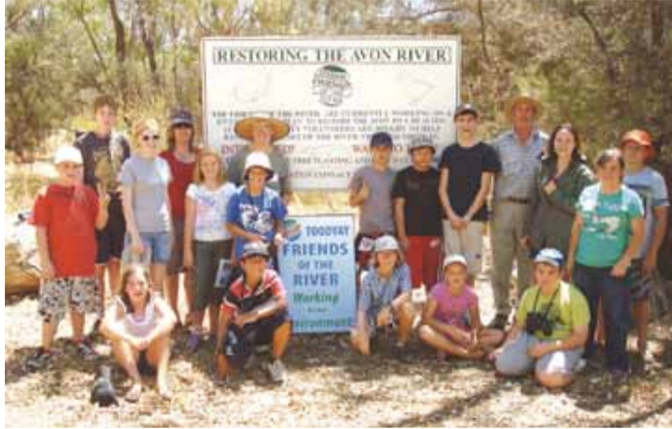
Toodyay visit February 2010

Since that time, Millennium Kids has developed as a non-profit, non-government organisation. It is run by young people, aged 10 to 25 years, and was established in response to their demand for a greater say about their environment and their world - and they are committed to improving our