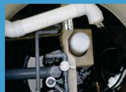
Service & Maintenance