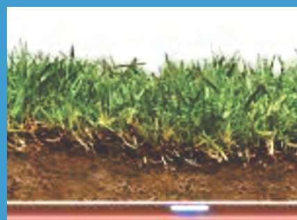
Irrigation and Pumps