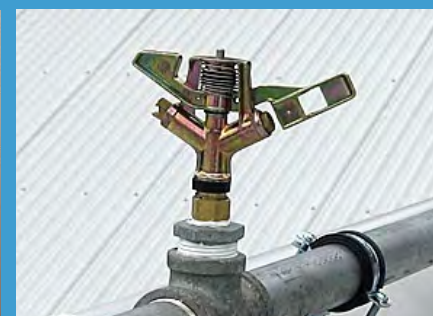
Fire Suppression systems