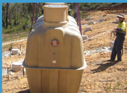
Septic Tanks and ATU systems